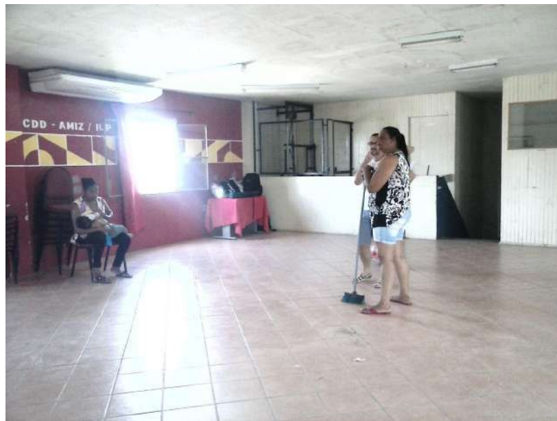
Fig. 5 - First moments of the Social Cartography at Dunas District.