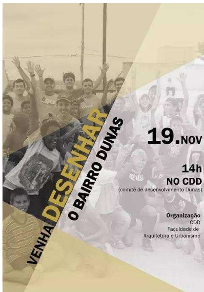
Fig. 12 - Advertisement poster for the workshop.