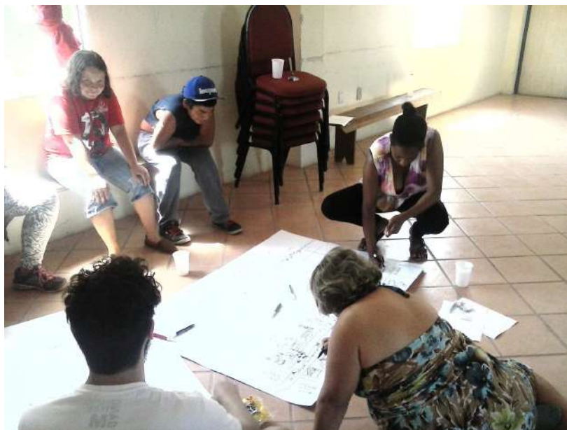
Fig. 8 - Moment of horizontal relationship and ways of articulating processes in the Social Cartography workshop at Dunas District.