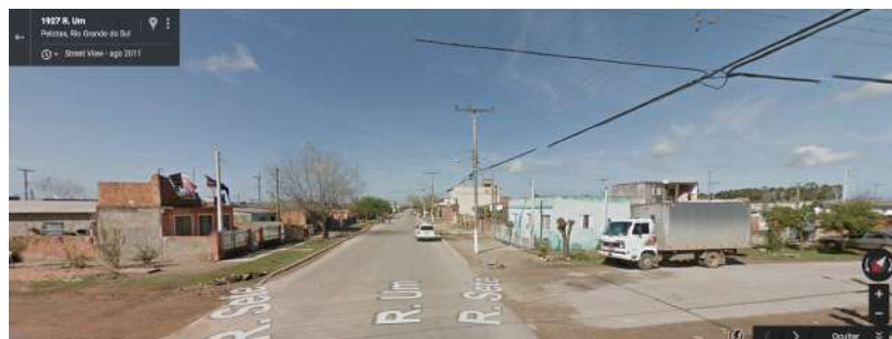
Fig. 4 - View from the CDD. Street One, at Dunas District.