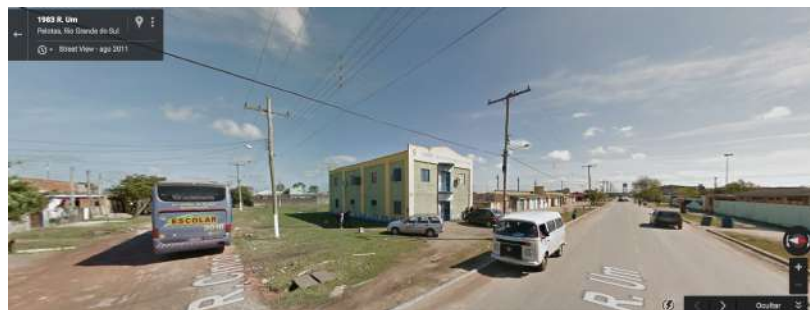
Fig. 3 – View on the CDD. Street One, at Dunas District.