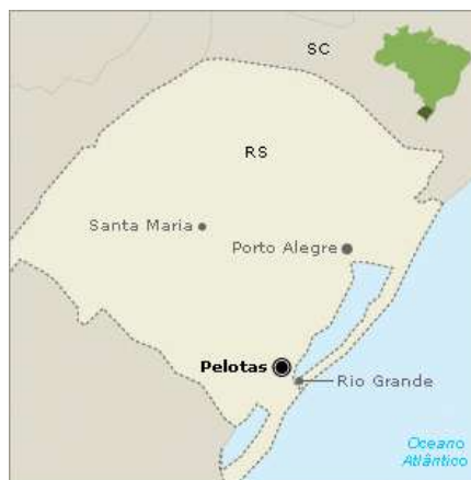
Fig. 1 - Map showing the location of the city of Pelotas at Rio Grande do Sul state, Brazil.

Dunas neighborhood origins go back to 1986, through a local action by the City Hall which appointed a 60-hectares area for implementing townhouses projects. Today, more than 20 thousand people live there. It is close to other outskirts neighborhoods like Areal and Bom Jesus. The name Dunas comes contradictorily from its "walled" vicinity to an upper-class social club with the same name (Mereb, 2011 & Soares Junior, 2011).