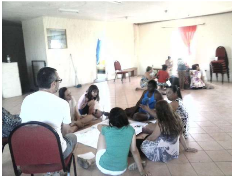
Fig. 7 - Moment of horizontal relationship and ways of articulating processes in the Social Cartography workshop at Dunas District.

In what concerns the body and the word, the agency with Alberto Sava (2009) points to their formation as social subjects, based in a verbal language structure. There is no doubt that the body must be imperatively observed and approached in Social Cartography. There is no final text without the body and there is no complete mediation without the body.