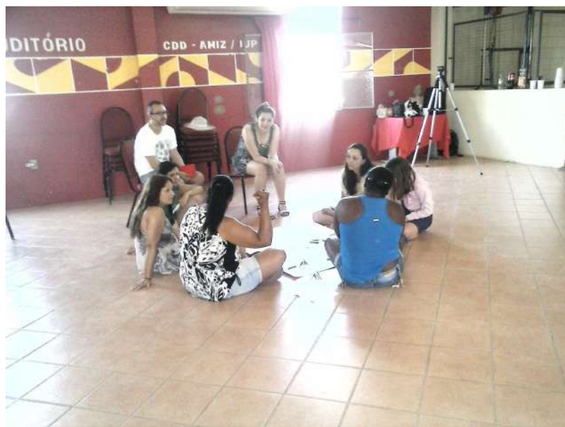
Fig. 6 - First moments of the Social Cartography at Dunas District.