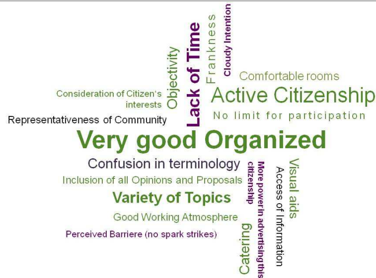
Figure 1. Illustration Feedback to the Course of Creative Workshop in Altona in September 2010 [translation by the author]. Illustration by student Viktoria Mutzek.