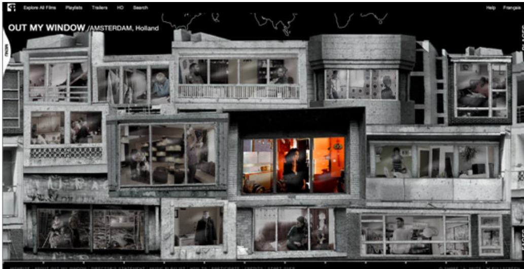
Figure 1 – Photo Courtesy of the National Film Board of Canada

one highrise building. Each apartment contains a panoramic view out the window to reveal the resident's interior and exterior environments.