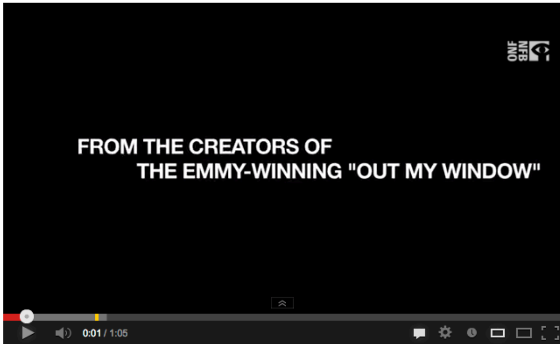
Figure 4. Video: 1 MILION TOWER TRAILER. Available at: http://www.youtube.com/watch?v=rzUb6LvOrI&feature=youtu.be

residents living in vertical suburbs. With limited access to resources, they have a different concept of the city than those who live in the downtown core. Through residents' stories we can gain a deeper understanding of gentrification, displacement, transit, labour, poverty, gender inequalities, etc. At Highrise we place an importance on developing working relationships with residents to enhance their creativity and storytelling abilities. Here the process is just as important as the end product. It's necessary for residents tell their stories from their point of view. This allows us to present the city in a holistic way--one that includes voices of people from diverse socioeconomic and cultural backgrounds. The ultimate challenge beyond making a documentary and presenting it is to inspire people to become active agents in our cities. Documentary can link the citizens to their city, it can move beyond the lens and mobilize people to transform their spaces in powerful ways.