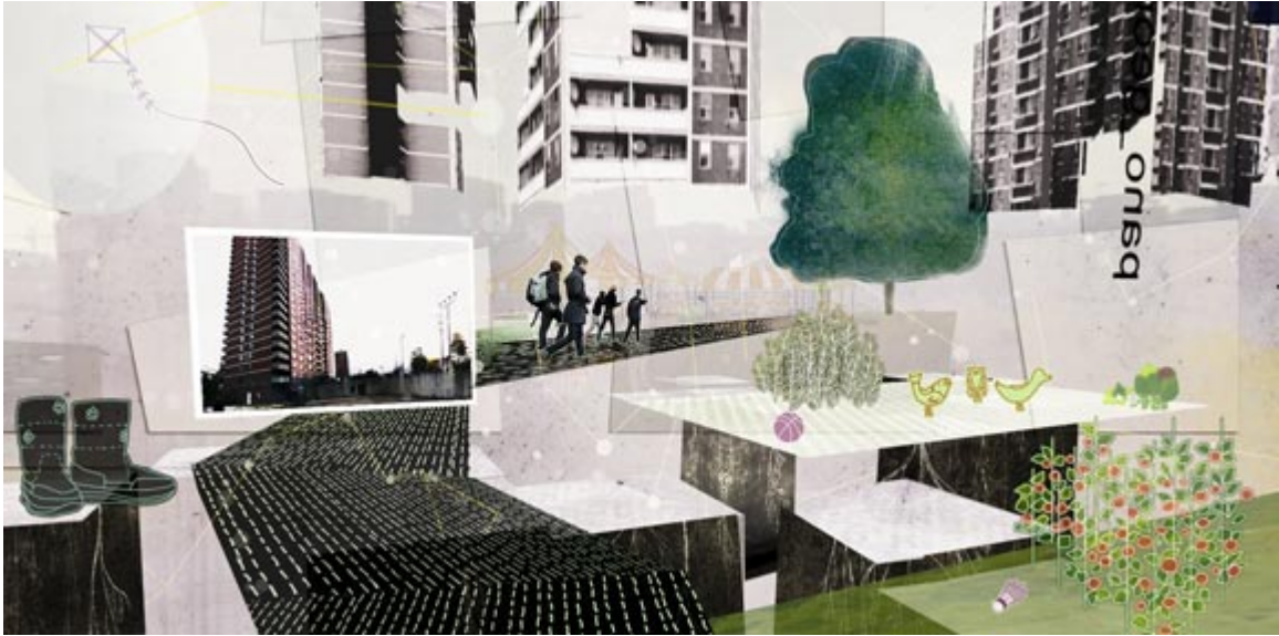
Figure 5. Illustration by: Lillian Chan, Howie Shia + Kelly Sommerfeld.