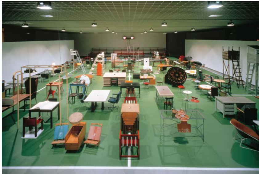
Figure 4. The Happy End of Franz Kafka's "Amerika". Museum Boijmans Van Beuningen, Rotterdam, 1994, mixed media, dimensions variable, © Estate Martin Kippenberger, Galerie Gisela Capitain, Cologne.

"The problem is not that of being free but of finding a way out..." (DELEUZE, GUATTARI, 1986, p.7-8)