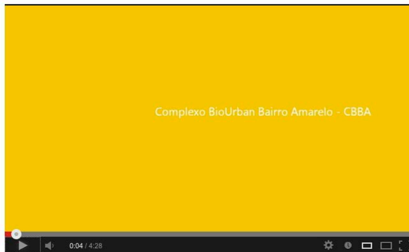
Figure 2. Unsolicited Urbanism, Hybrid Urbanism. BioUrban Complex, Bairro Amarelo, ressignificação do espaço. São Paulo. Jeff Anderson e Biourban. (Available at: http://www.youtube.com/watch?v=BADKZF5o7OU )

Emerges a contagious power of reinvention in these large urban clusters. People and cities that are being rediscovered in a creative and innovative way, rebuilding their destiny after periods of decline and generating hybrid situations contaminated by old pre-existing conditions and the emergencies of the new: opportunities, programs, events, people.