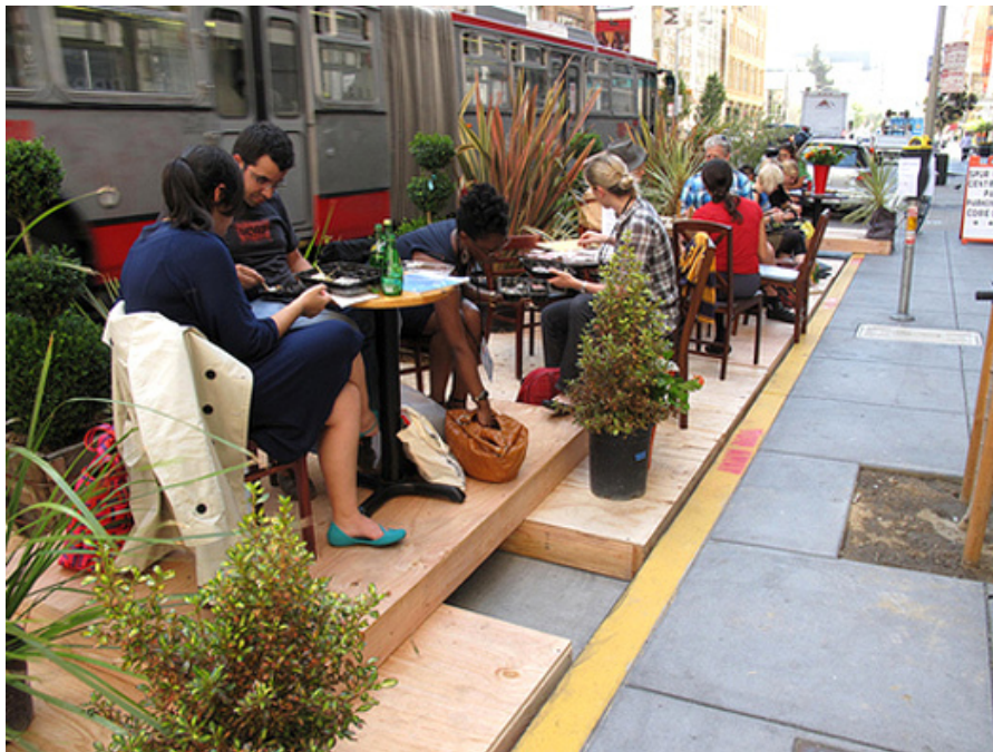
Figure 3. DIY Urbanism, SPUR, San Francisco. 4

What are they looking for? Urban density and sustainability, city amenities, public transportation and good public spaces crowded of diverse people.